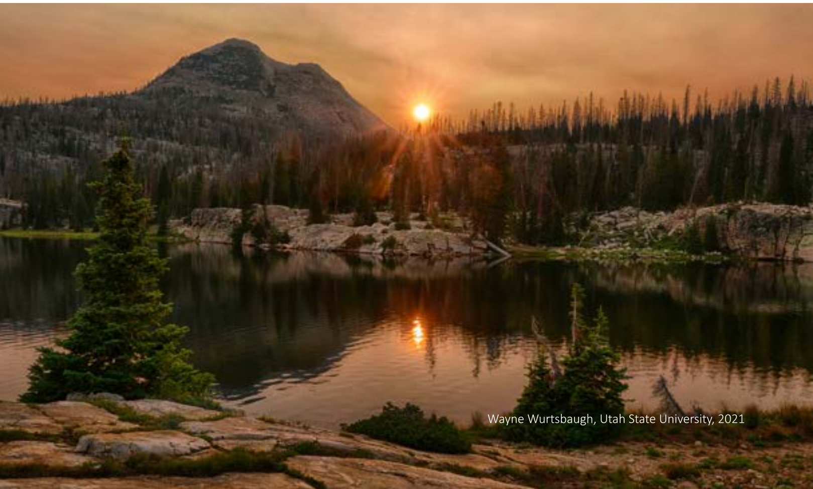
Wayne Wurtsbaugh, Utah State University, 2021

Measuring and tracking the results of water and land use integration is vital to determining whether your community’s plans and goals are being met. Growing Water Smart Metrics: Tracking the Integration of Water and Land Use Planning offers a set of indicators that can be assessed for year-over-year trends to demonstrate achievement of water savings through land use planning. Ten progress metrics track whether: the community’s land use plan integrates water efficiency and its water plan integrates land use strategies; conservation-oriented system development charges and pricing structures are being used; indoor and outdoor water efficiency measures are being utilized; and collaboration around development proposals is occurring. Fourteen impact metrics measure increasing or decreasing trends in water demand and use and trends in development patterns and land use.