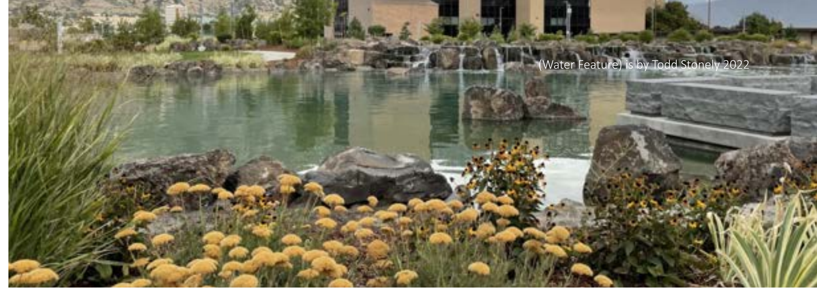
(Water Feature) is by Todd Stonely 2022