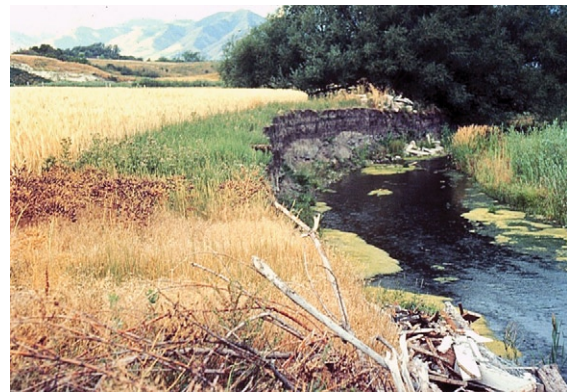
Figure 1. This photo shows an example of a typical eroding streambank in the Little Bear River watershed before the restoration project began.

The Little Bear River total maximum daily load (TMDL) outlines several goals, including that TP concentrations may not exceed the water quality standard, 0.05 milligrams per liter (mg/L), and that the TP load will be reduced by 13 kilograms per day (kg/day) above Cutler Reservoir and 2.4 kg/day above Hyrum Reservoir. Although the goal is to not exceed the TP standard at all, a stream is not actually identified as non-supporting until 25 percent or more of its samples exceed the 0.05 mg/L TP value. Therefore, to meet water quality standards, the TP levels in Little Bear River must not exceed