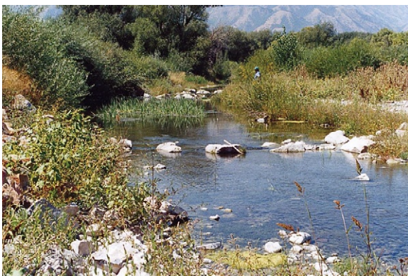
Figure 2. This photo shows an example of a restored stream channel in the Little Bear River watershed after significant restoration had taken place.

The cumulative effects of these on-the-ground restoration efforts, combined with outreach and education activities, have led to better land use practices by landowners and reduced pollutant loadings to the streams (Figure 2). Data show that water quality in both segments of the Little Bear River has significantly improved. Figure 3 presents the percentage of samples exceeding the TP standard during three periods of intensive monitoring conducted since 1993. The TP levels in the upper segment decreased from 34 percent exceedance of the standard in the 1993–1994 monitoring cycle to 8 percent exceedance by the 2003–2004 cycle. The TP levels in the lower segment decreased from 88 percent exceedance of the standard in the